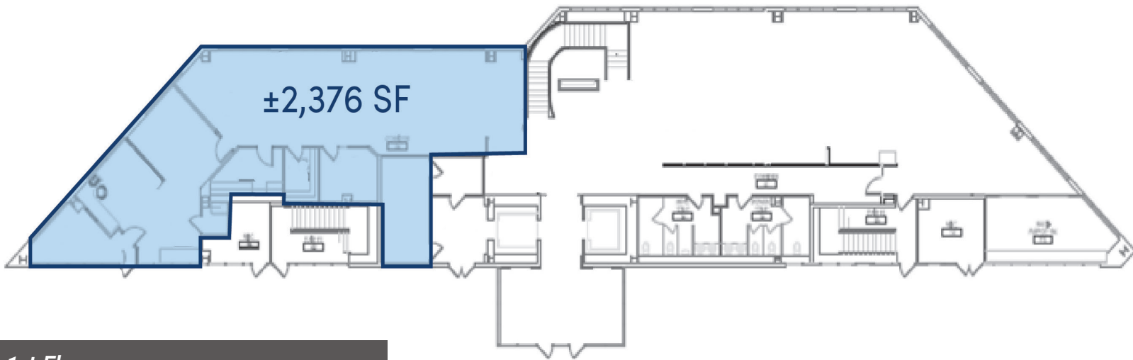
1st Floor \pm 2,376 SF