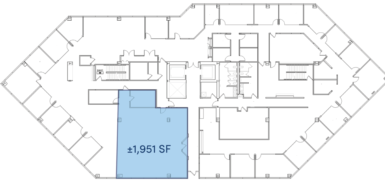
3rd Floor ±1,951 SF