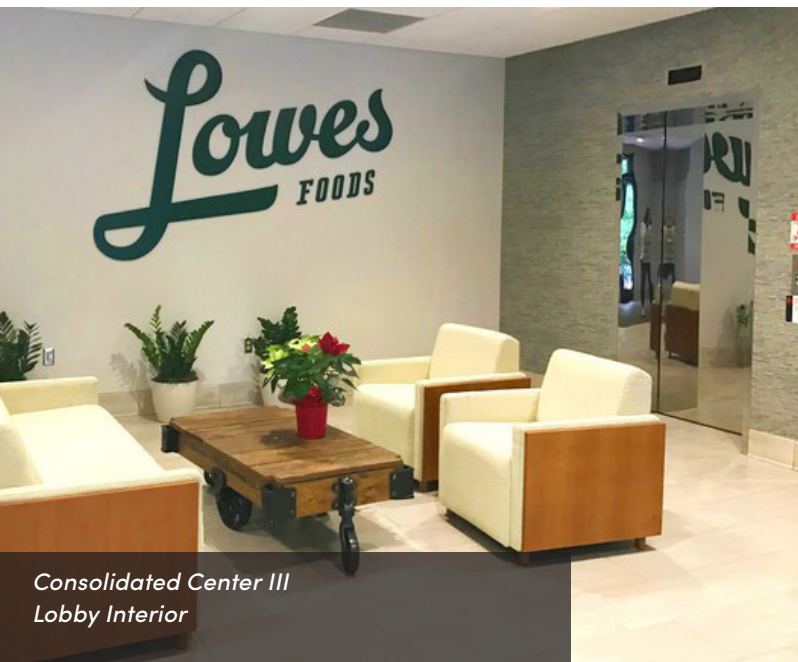
Consolidated Center III Lobby Interior