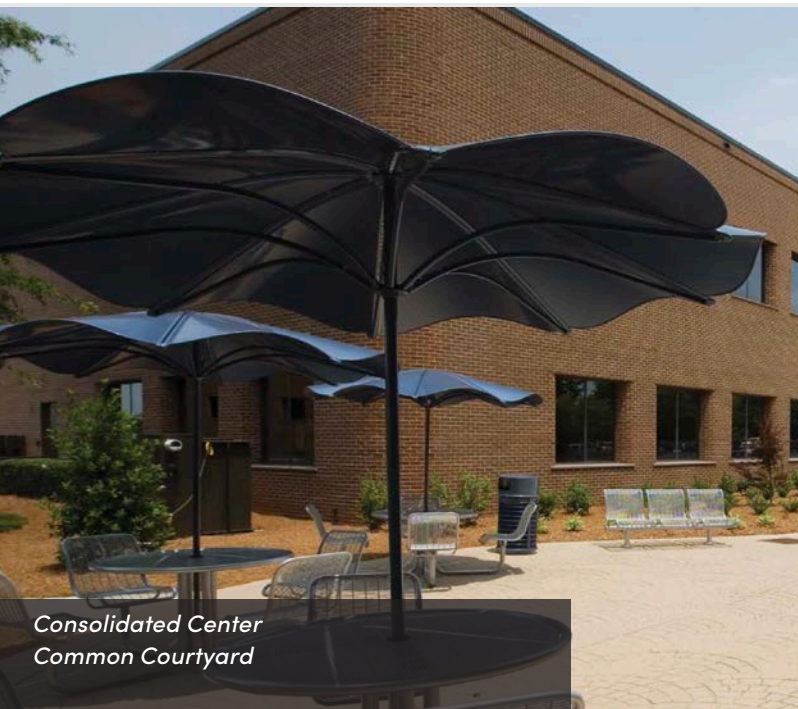
Consolidated Center Common Courtyard