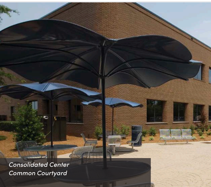
Consolidated Center Common Courtyard