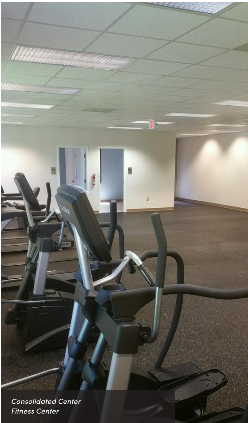
Consolidated Center Fitness Center