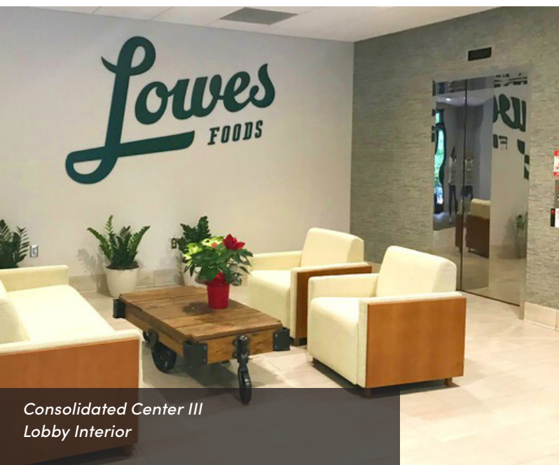
Consolidated Center III Lobby Interior