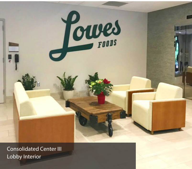
Consolidated Center III Lobby Interior