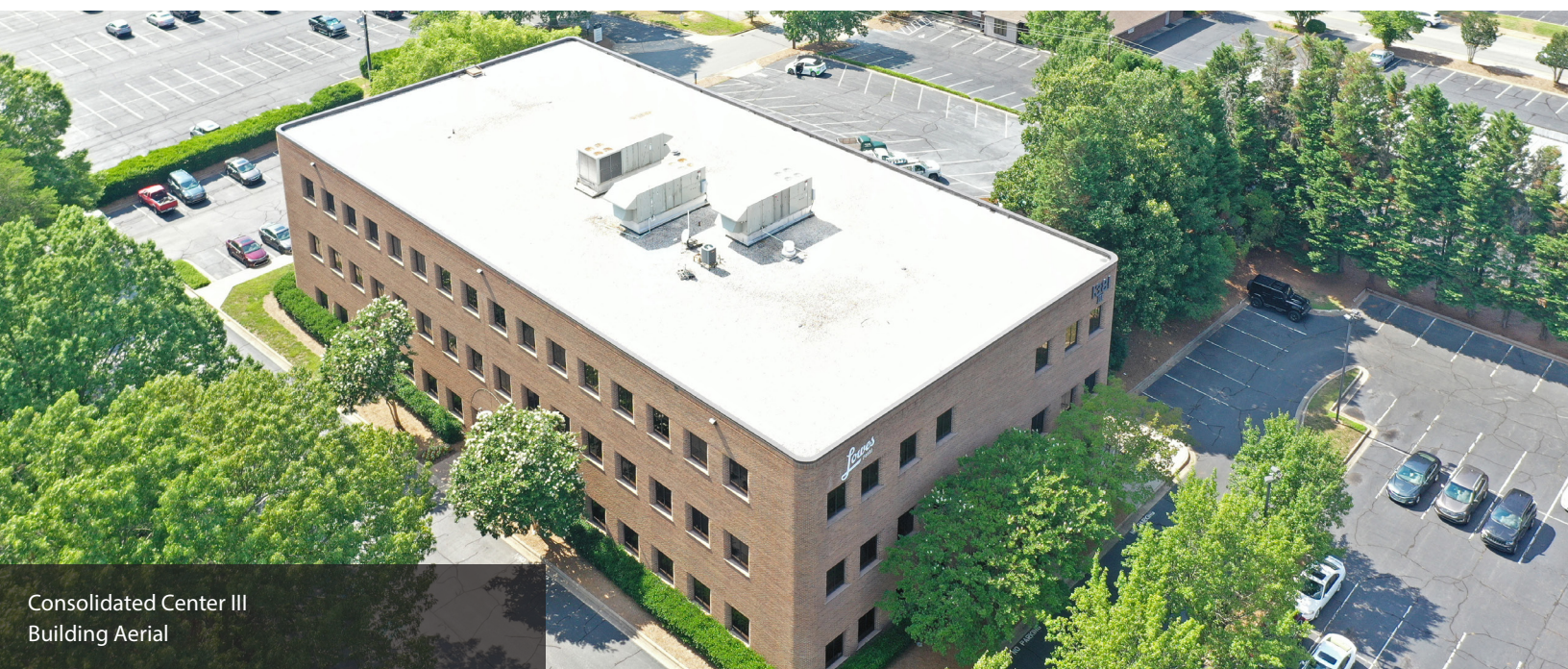
Consolidated Center III Building Aerial