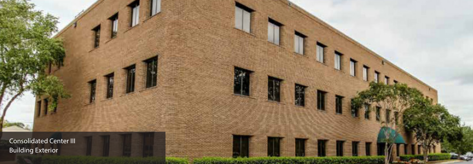
Consolidated Center III Building Exterior