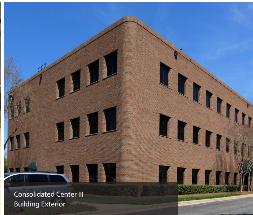
Consolidated Center III Building Exterior