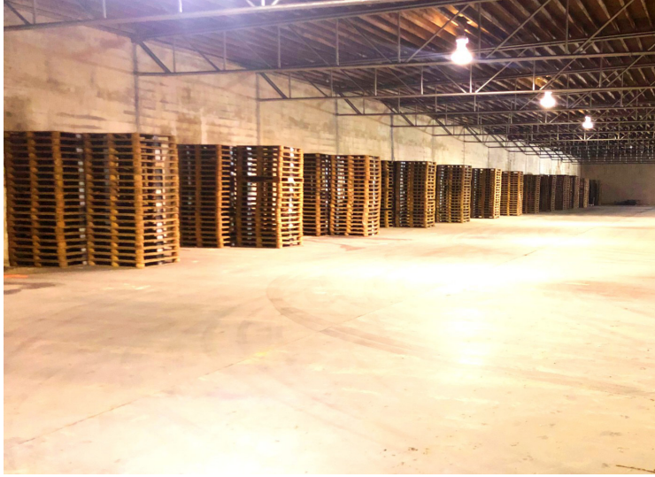
5709 Robin Wood Lane Warehouse