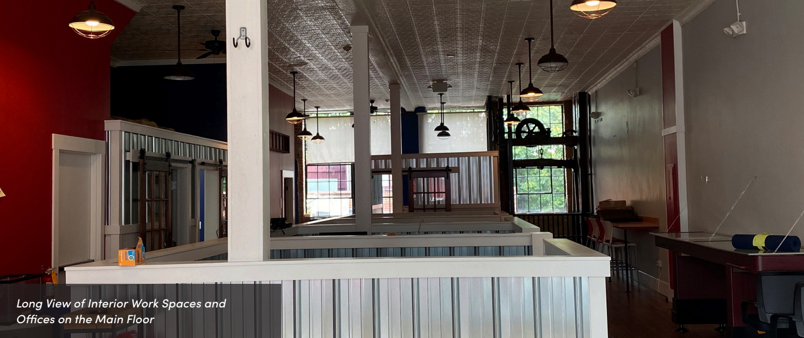
Long View of Interior Work Spaces and Offices on the Main Floor