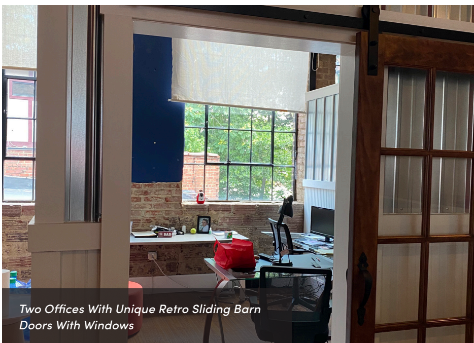
Two Offices With Unique Retro Sliding Barn Doors With Windows