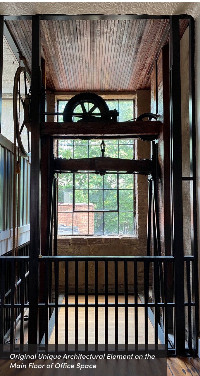
Original Unique Architectural Element on the Main Floor of Office Space