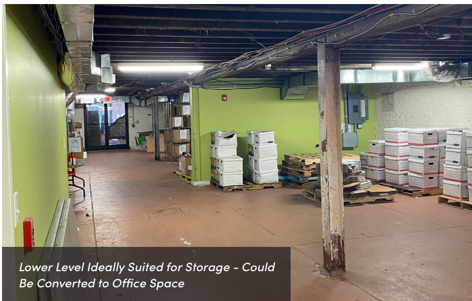
Lower Level Ideally Suited for Storage - Could Be Converted to Office Space