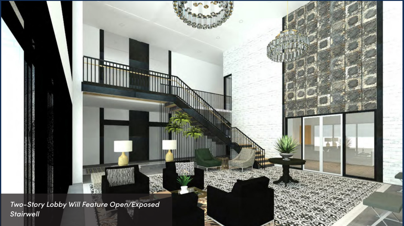
Two-Story Lobby Will Feature Open/Exposed Stairwell

A mixture of High Point's historic arts center and furniture industry will be reflected in a contemporary, bright and airy lobby that takes advantage of the city's abundant sunshine.