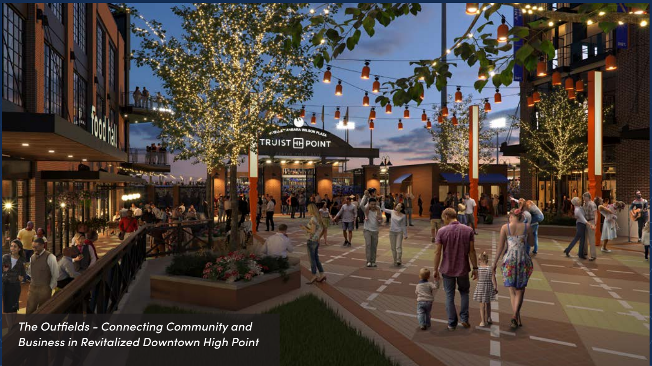
The Outfields - Connecting Community and Business in Revitalized Downtown High Point