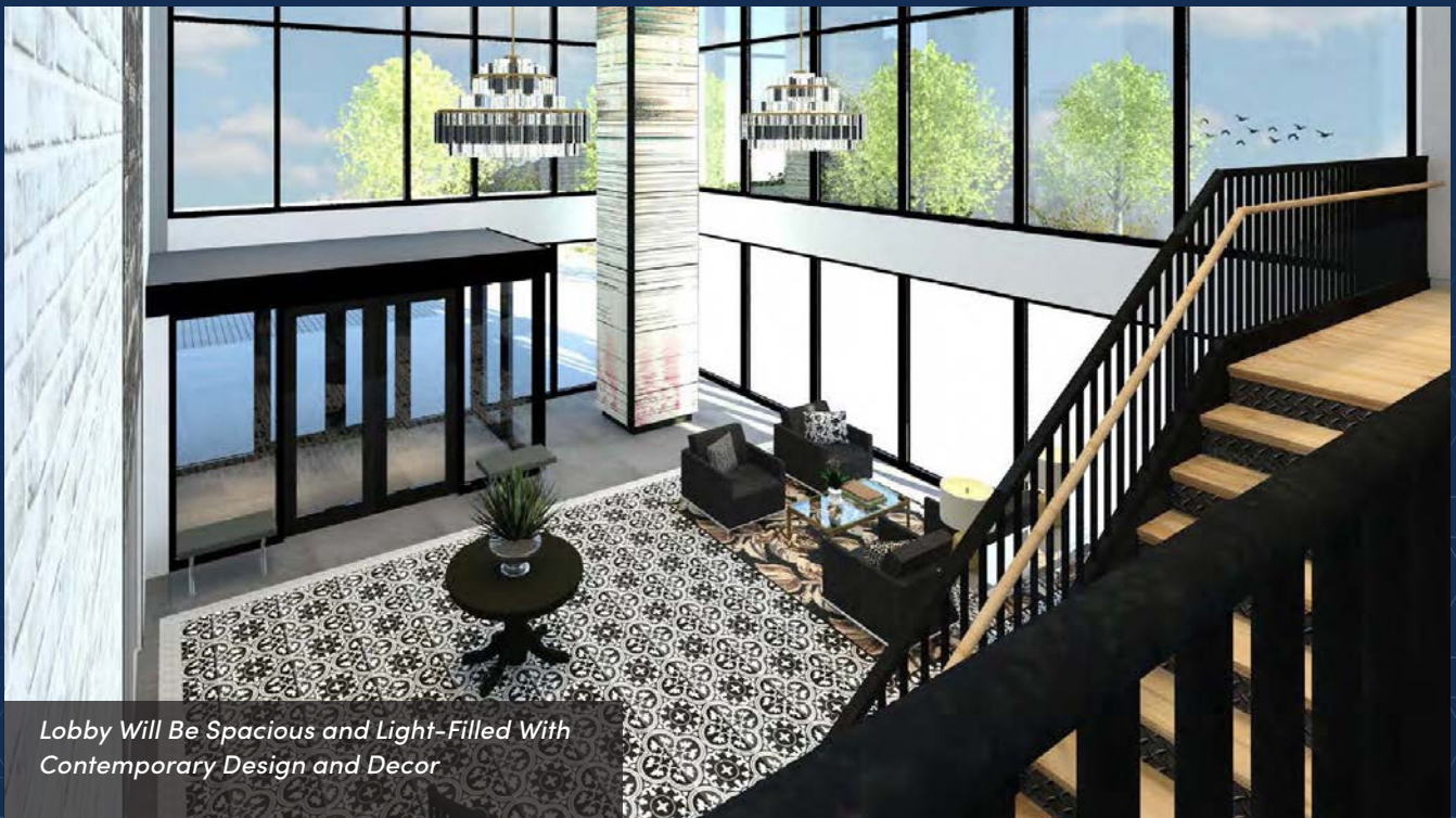
Lobby Will Be Spacious and Light-Filled With Contemporary Design and Decor