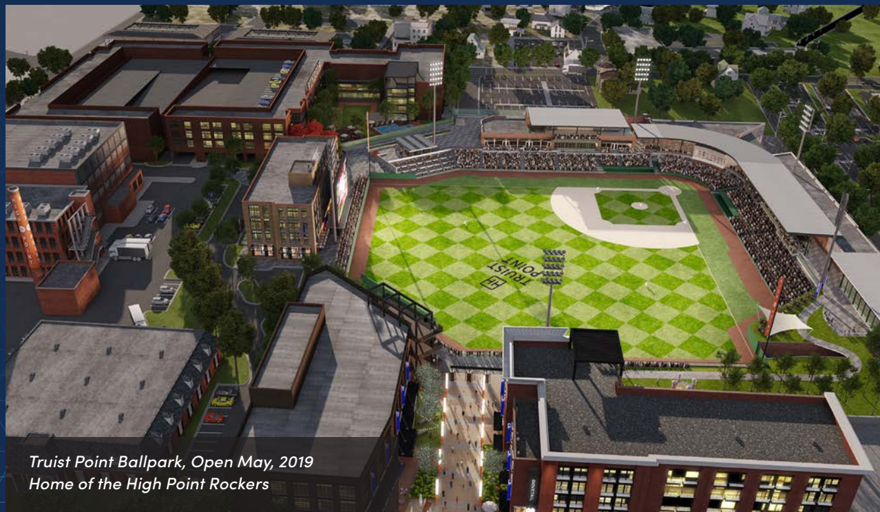
Truist Point Ballpark, Open May, 2019 Home of the High Point Rockers