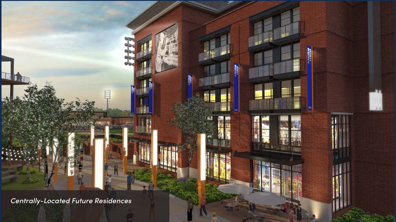
Centrally-Located Future Residences

The Outfields master plan includes the addition of beautifully-designed and amenity-rich residences centered around Truist Point Stadium in downtown High Point. The revitalized location invites families, local businesses and market-goers to a new, year-round community-focused environment that includes 275 North Elm as a vital part of the project.