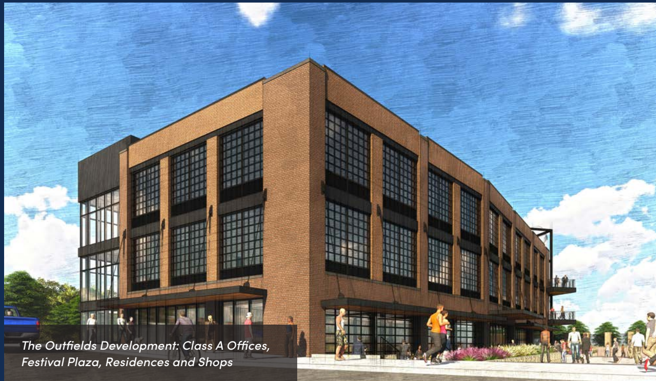
The Outfields Development: Class A Offices, Festival Plaza, Residences and Shops

A catalyst development project is happening at the center of High Point, NC, featuring residences, Class A offices, shops, and a grand plaza just beyond the outfield of the new Truist Point baseball stadium, which opened in May of 2019. The Outfields development will be donned with the art and history of the local furniture heritage, and will be a place of community – attracting people to work, live, and play in the city.