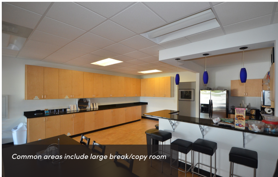
Common areas include large break/copy room