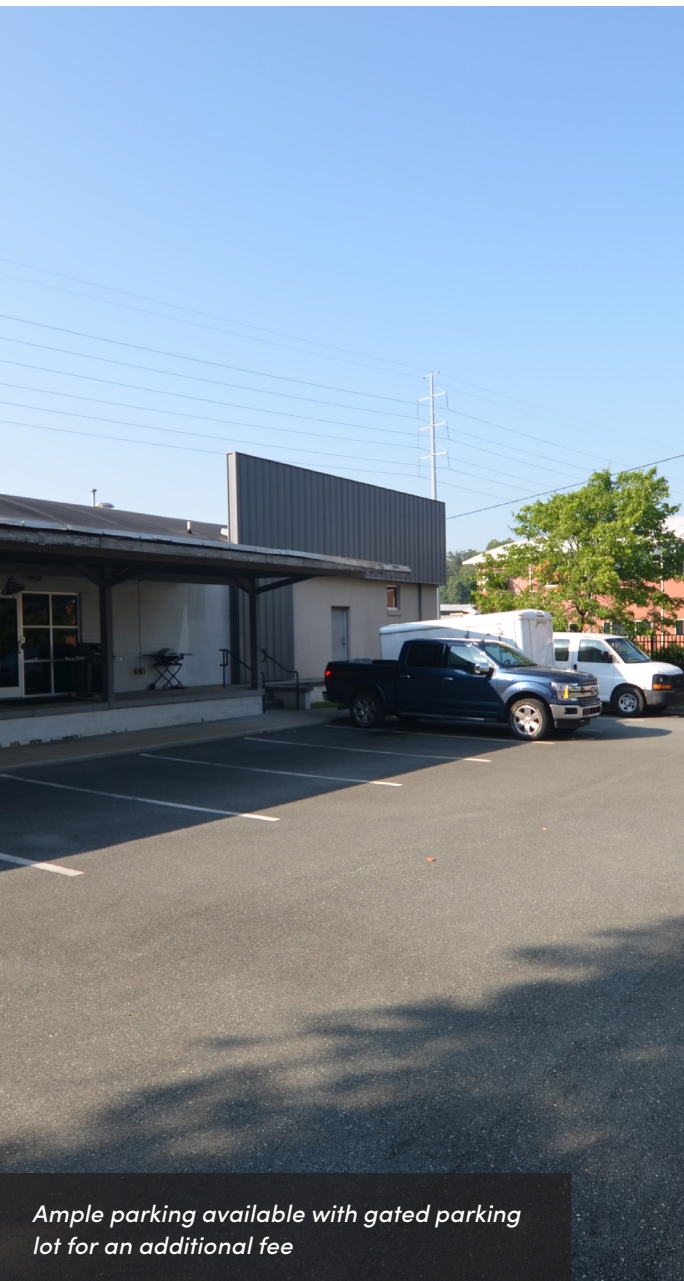
Ample parking available with gated parking lot for an additional fee