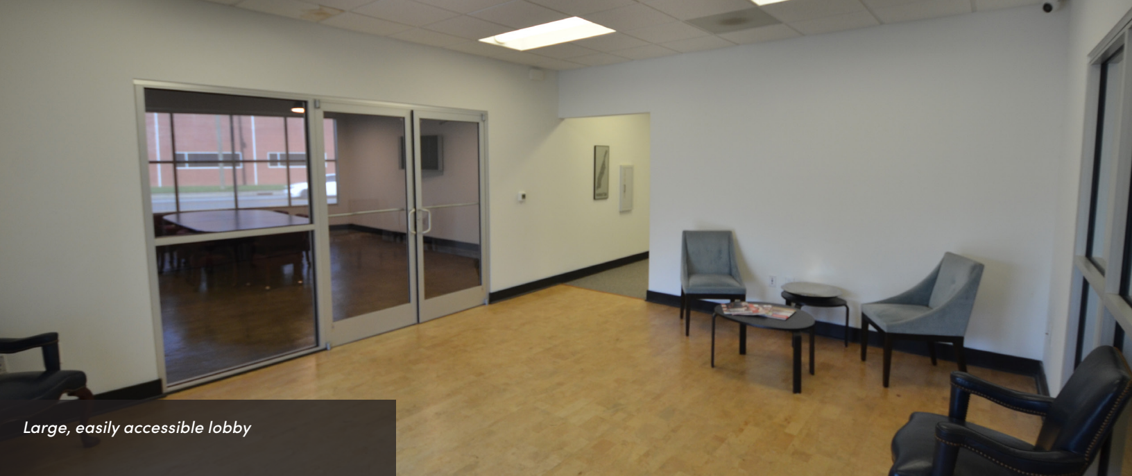
Large, easily accessible lobby