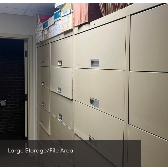
Large Storage/File Area