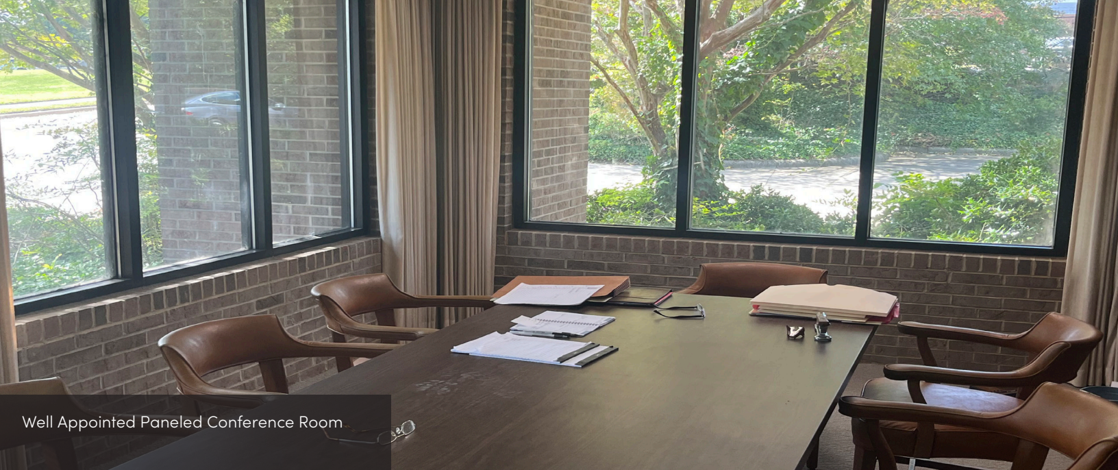
Well Appointed Paneled Conference Room