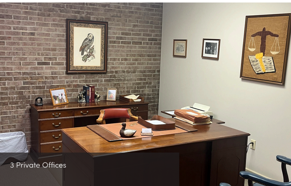
3 Private Offices