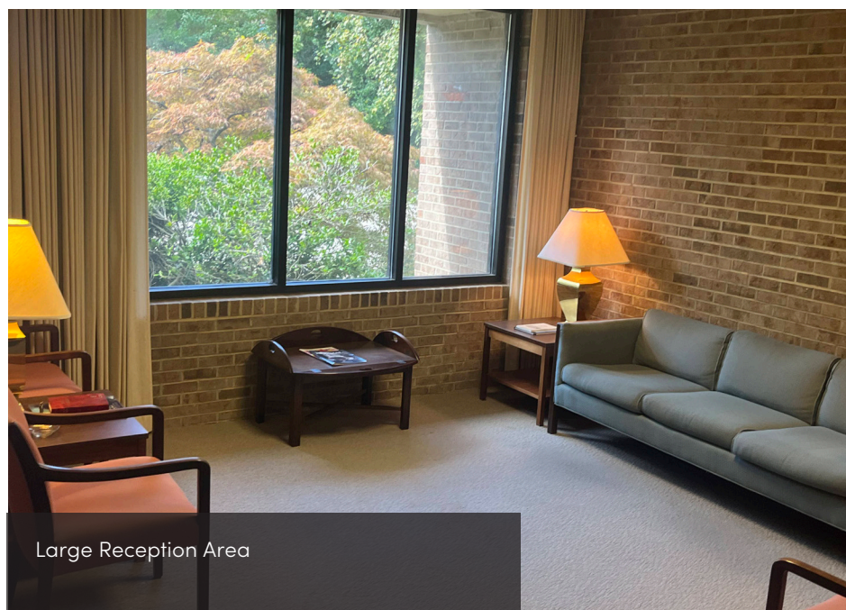
Large Reception Area