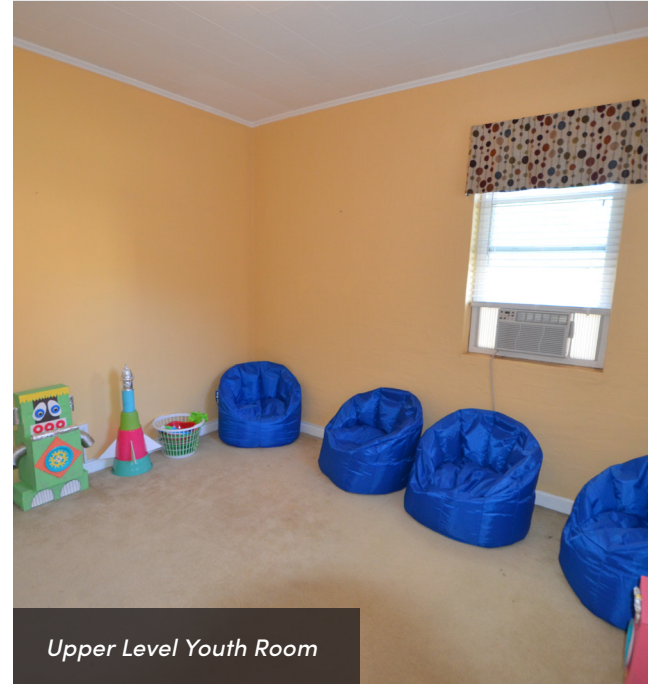
Upper Level Youth Room