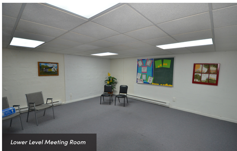
Lower Level Meeting Room