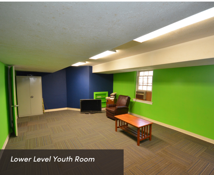
Lower Level Youth Room