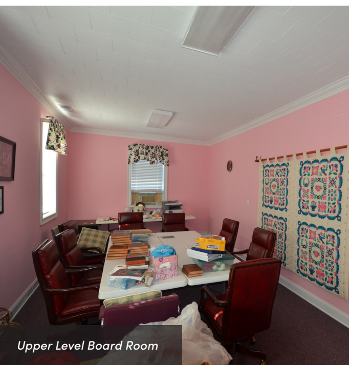
Upper Level Board Room