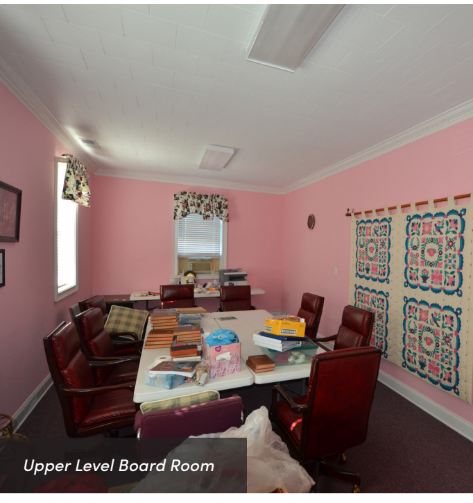
Upper Level Board Room