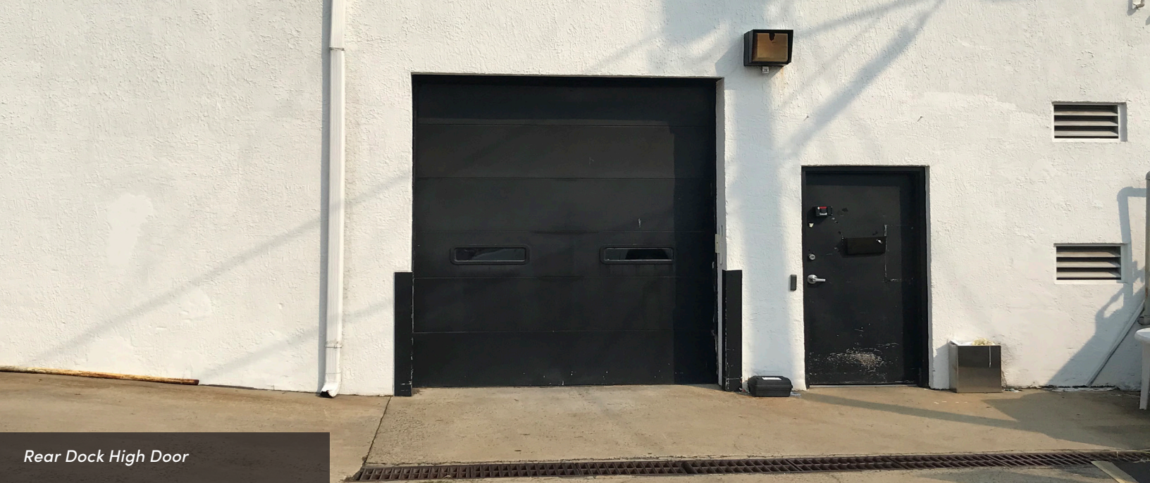
Rear Dock High Door