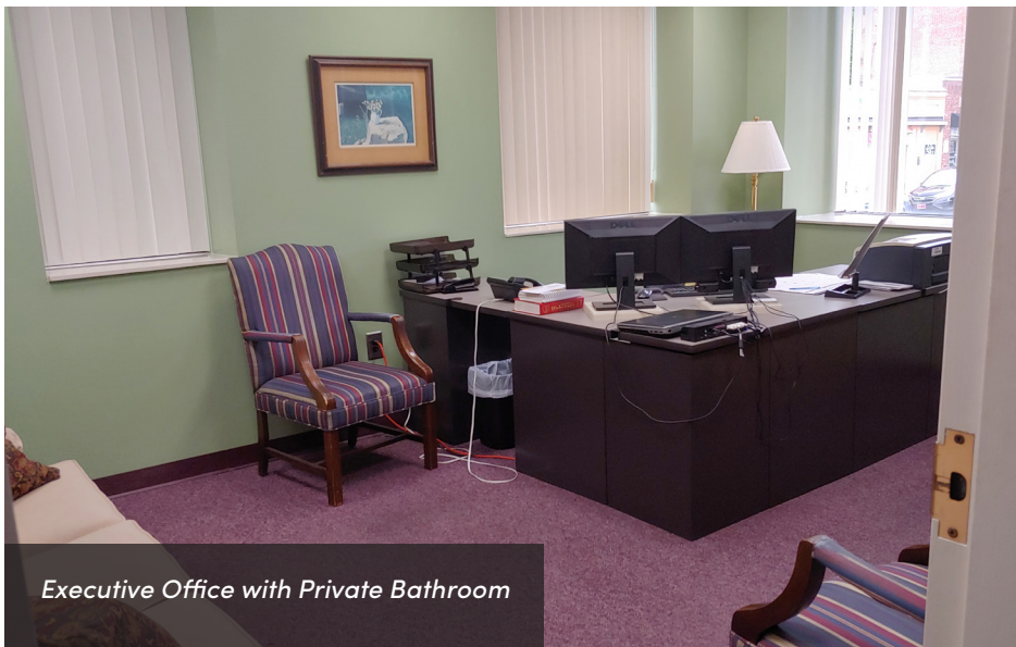
Executive Office with Private Bathroom