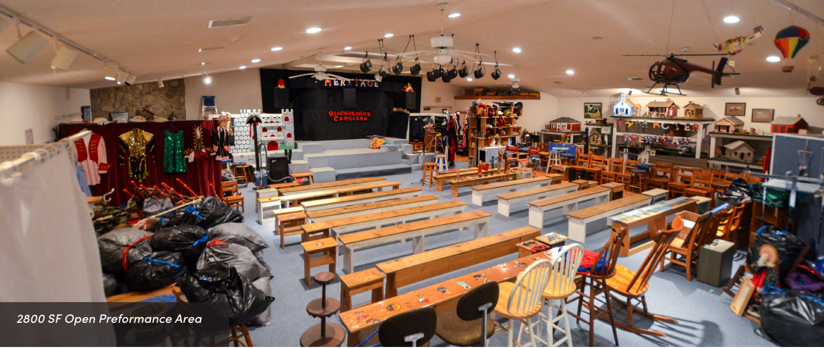
2800 SF Open Performance Area