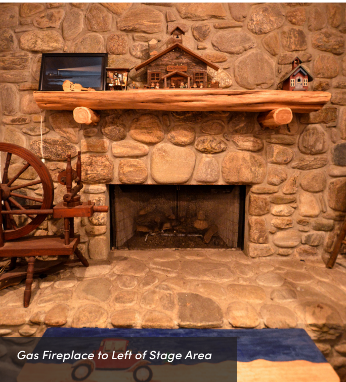
Gas Fireplace to Left of Stage Area