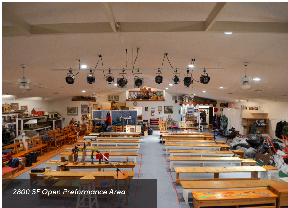
2800 SF Open Performance Area