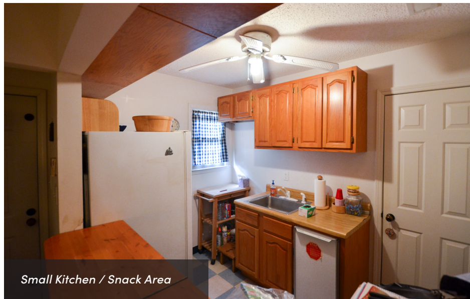
Small Kitchen / Snack Area