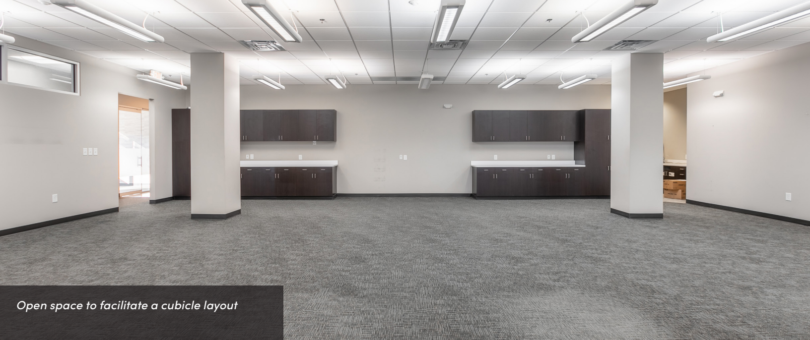
Open space to facilitate a cubicle layout