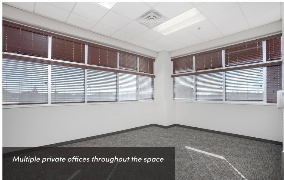
Multiple private offices throughout the space