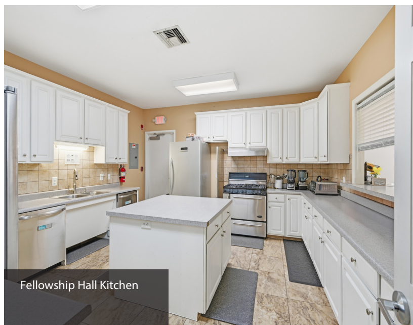
Fellowship Hall Kitchen