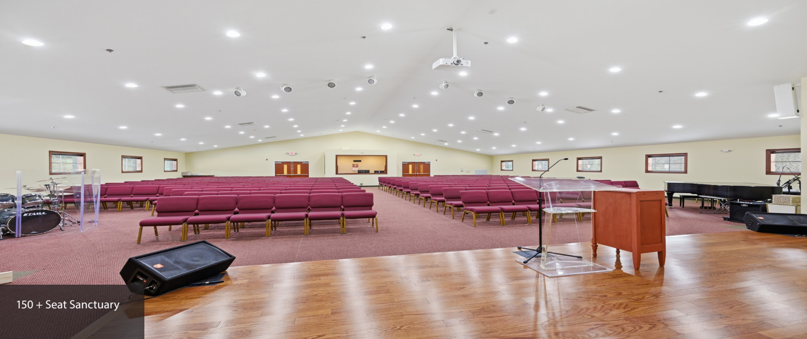
150 + Seat Sanctuary