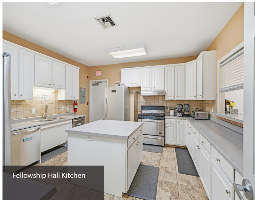
Fellowship Hall Kitchen