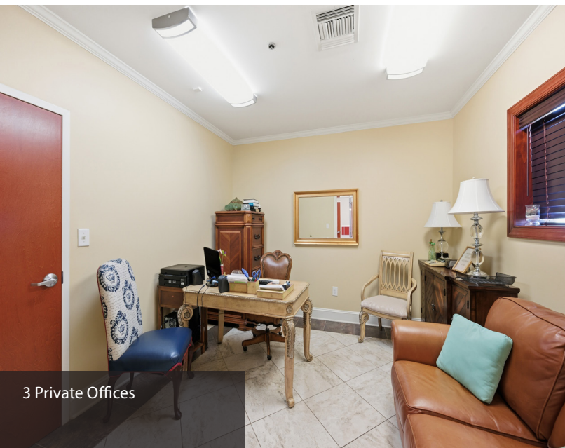
3 Private Offices