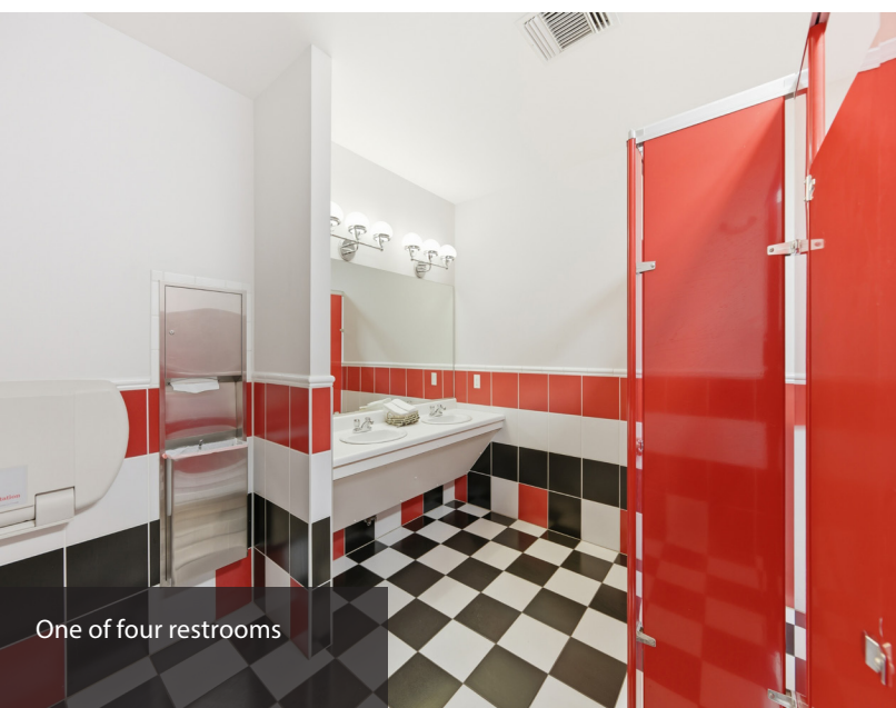
One of four restrooms